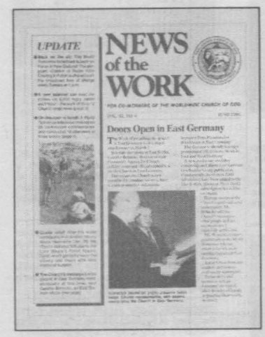
NEWS OF THE WORK

PASADENA-News of the Work, the Church's monthly coworker newsletter, has produced more than 135,000 literature requests since April 1989, according to Media Operations.